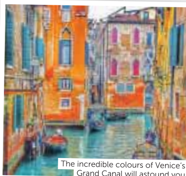
The incredible colours of Venice's Grand Canal will astound you