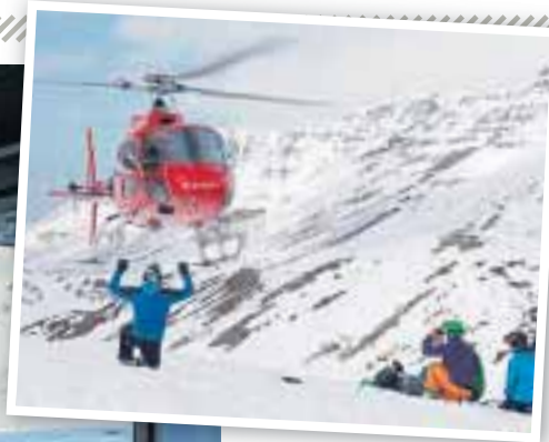
Eleven-plus: A helicopter 'drop' is a big thrill for skiers who travel with Eleven Experience in Iceland