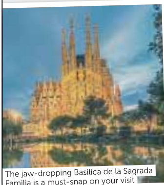
The jaw-dropping Basilica de la Sagrada Familia is a must-snap on your visit