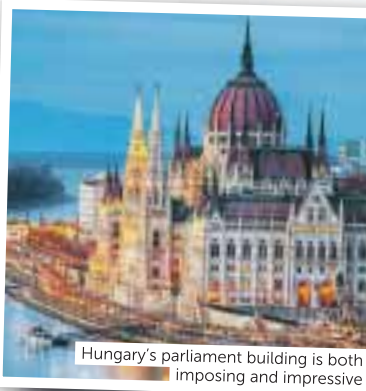
Hungary's parliament building is both imposing and impressive