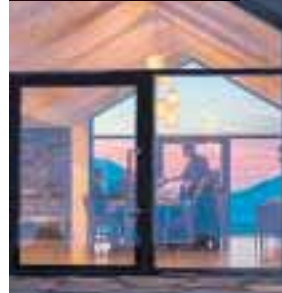
See the light: Guests enjoy superb views and a private chef's dishes at Deplar Farm

beach, where snow turns to yellowy-green moss. But this so-called lack of snow hasn't stopped our enjoyment – we've had ten