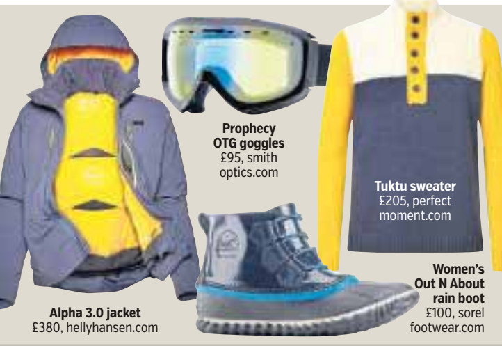
Prophecy OTG goggles £95, smithoptics.com

From £1,915 per room per night, based on two sharing, includes guide service, activities kit, all meals, alcohol, minibar, and transfers. Heli-skiing £2,120, per person per day (four days minimum). elevenexperience.com